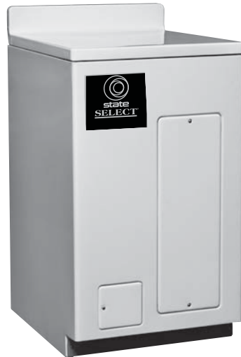
Table Top Electric Water Heaters features convenient flat surface at 36" height, providing extra "counter space" wherever installed.

All plumbing and electrical connections are made through back of water heater. 27 and 40-gallon tank capacities. Equipped with PEXAN™ cross linked PEX polymer dip tube.