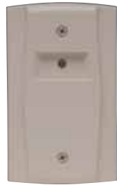
RA100Z UL S2522