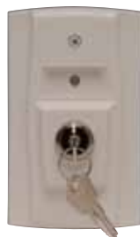
RTS151KEY UL S2522