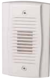
MHW UL S4011