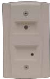
RTS151 UL S4011

System Sensor provides system flexibility with a variety of accessories, including two remote test stations and several different means of visible and audible system annunciation. As with our duct smoke detectors, all duct smoke detector accessories are UL listed.