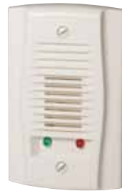
APA151 UL S4011