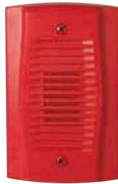
MHR UL S4011