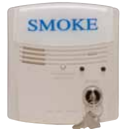
RTS2-AOS UL S2522