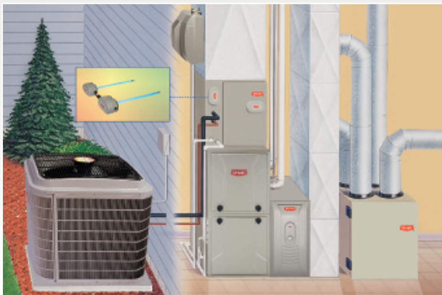
Air Conditioner and Gas Furnace System